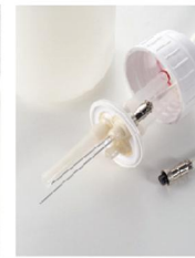
Waste water sensor