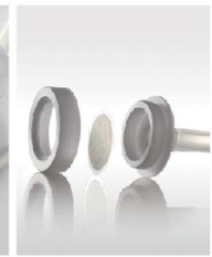
Wash bottle filter